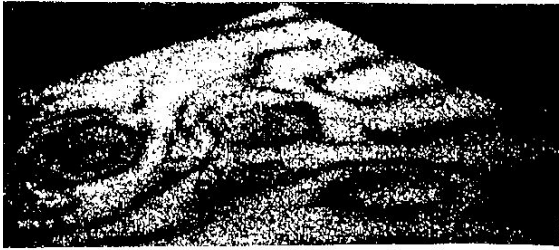
Figure 4. Narrow peak at the G3 string, observed at 195.9 Hz

the soundboard in Figure 4 relate to second harmonics of the G3 string.