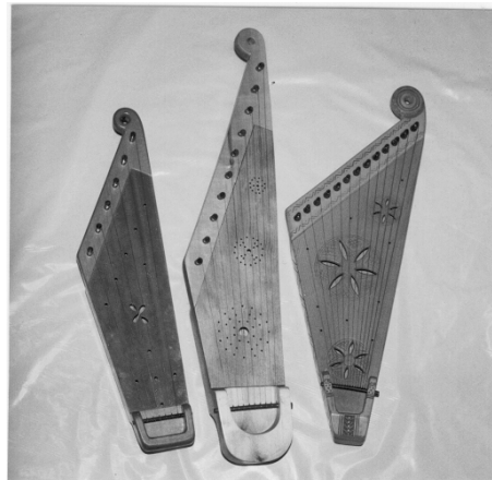
Figure 1. Three carved Baltic psalteries included in a previous study, from left: AP1, AH19 and KD9.

Latvia. It has 12 strings and a soundhole rosette symbolizing a sun-wheel with six rays at the center, surrounded by an array of 18 small circular holes, plus two other rosettes, each with six small circular holes. The tuning is diatonic, in the key of C, from G3 through D5.