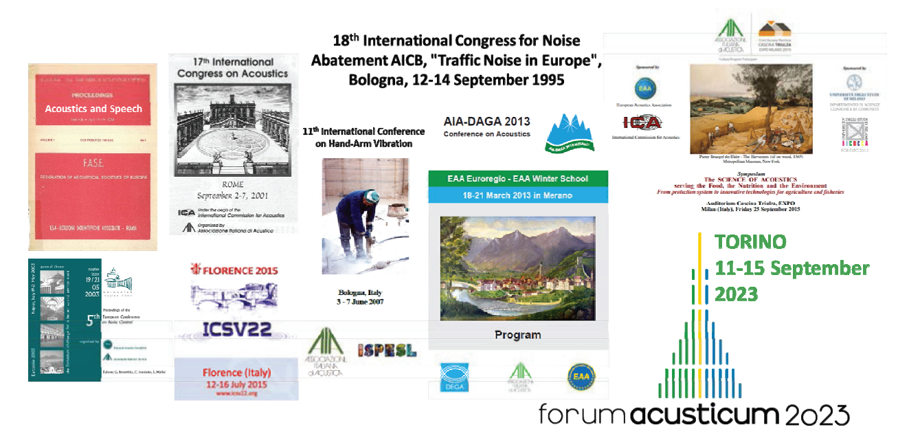
Figure 2. The main international events organized by AIA.

Some AIA members have been appointed of managerial positions in all the above organizations over the years. Figure 2 outlines the main international events above mentioned.