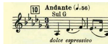
Figure 1. Excerpt from the Glazunov concerto

We recorded a semi-professional violinist in a large seminar room, playing a short excerpt from the Glazunov concerto (Fig. 1) on the ten violins described above. The position of the player was kept constant relative to the microphone (DPA 2006C) throughout the session, at a distance that had been adjusted at the beginning of the session to obtain pleasant recordings.