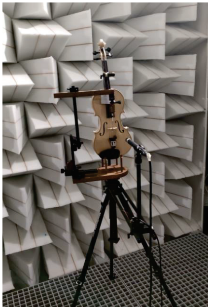
Figure 4. Radiation measurement rig

This hybrid synthesis allows to drive different virtual violins by the same realistic forcing waveform (measured during real playing) so that sound differences can be compared with no complications arising from variations in playing.