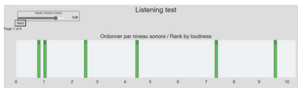
Figure 5. Listening test interface: Ranking by timbre for the ABCD set (top) and ranking by loudness for the Bilbao set (bottom).