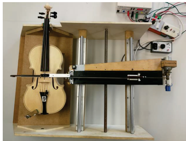
Figure 3. Bowing machine

The goal of this methodology is to replace a not so reproducible player by a reproducible excitation (though artificial). The bowing machine is shown on Fig. 2. The ten violins were recorded on each of the four open strings with an omnidirectional microphone (DPA 2006C) placed vertically above the bridge at a distance of 185 mm when the violin lays flat. That distance was adjusted to have, qualitatively, a strong direct sound with a bit of reverberation, in the room that was available at the time to make the recordings (different from the seminar room used for the live recordings). The violins were rotated for the different strings in order to keep a bowing direction tangent to the bridge curvature.