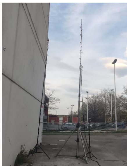
Figure 3. Side view of the microphones array.

covered area is about 38 m 2 . The acquisition system was an 8-channel analyzer, 6 of them were used in microphone array, and other two were used as control points, leaving them fixed during each acquisition and for each speaker. The first control point was at the height of 1.5 m from the ground and 2 meters from the facade, and the second was at a height of 5.2 meters and 2.4 meters from the facade.