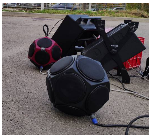
Figure 4. Sound sources, from front to back: DIY black dodecahedron; Phon-X Omni red dodecahedron; Phon-X NGS-1 directional

sound source in the middle; B&K 4224 directional sound source behind.