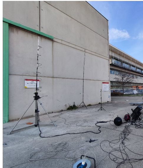
Figure 2. Image of test area and instrumentation used.

To measure the sound pressure level, a microphone grid of 10x12 microphones with a horizontal pitch of 0.8 m and a vertical pitch of 0.4 m from the minimum height of 1.5m and 2 meters away from the façade, was used. The total