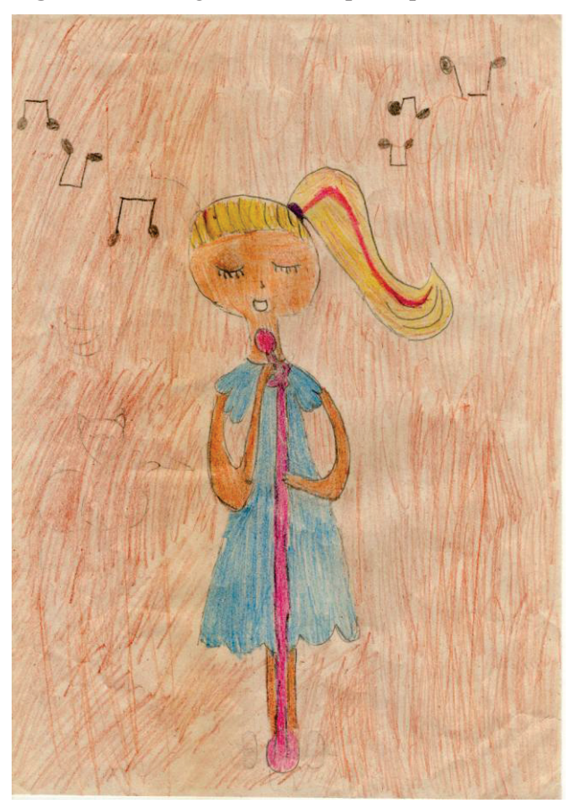
Figure 2. Drawing of one of the participants.