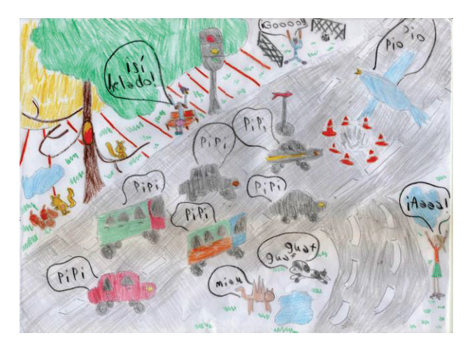
Figure 1. Drawing of one of the participants.

Among the works presented from all over the country, the jury selected seven finalists.