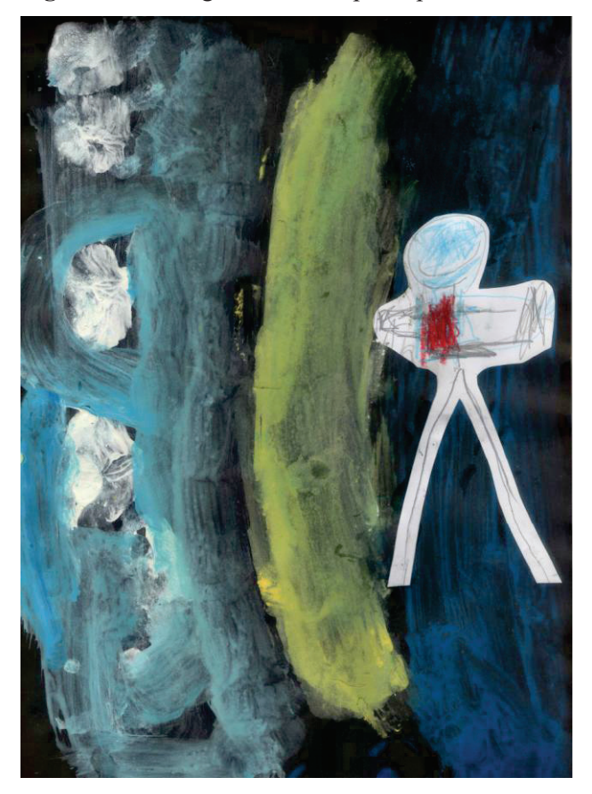
Figure 4. Drawing of one of the participants.